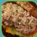
3. Canned/ Pouched Tuna